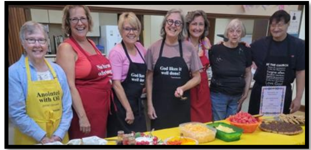
United Church of Christ Team Members