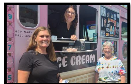
First United Methodist Team Members and the Sugar Rush Ice Cream Truck