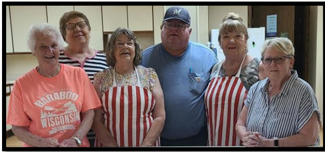
First Presbyterian Church Team Members

What a blessing the Summer Lunch Project was! We averaged 50 – 60 guests every day, with half being adults, and half children. The total number of meals served as of August 27 was 1,746, and that was with three more days to go! We are so thankful for every single person, group, and organization that donated their time, food, and skill to this project. It has grown exponentially since it's humble beginnings, and blessed many in our community.