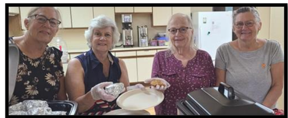
New Life Advent Christian Church Team Members