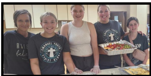
Emmanuel Methodist Team Members